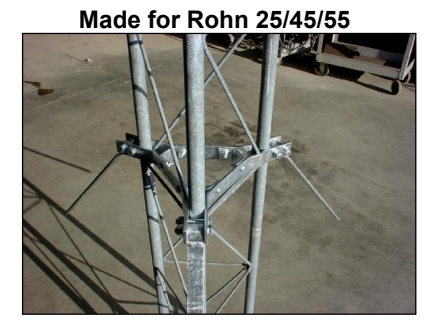
Base Plates Made for Rohn 25/45/55