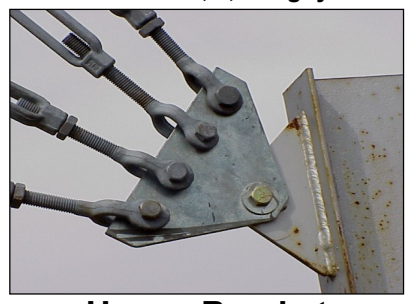
House Brackets Made for Rohn 25/45/55

( 3 pcs to a set) Available in 3, 4, & 5 guy sets