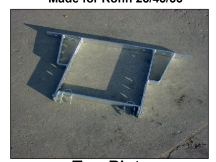
Top Plates Medium duty made for Rohn 25 and American Tower