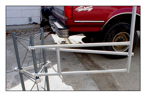
Hinged Base Plates Made for Rohn 25/45